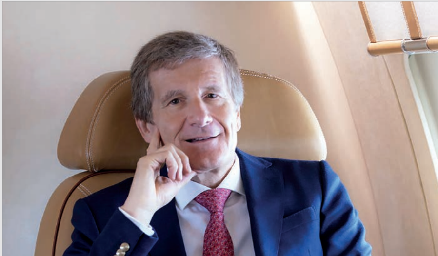
Thierry Boutsen | Chairman & Founder

Thierry Boutsen's passion for aviation began during his studies in mechanical engineering. After graduating, he continued to push his limits both intellectually and physically by becoming a professional racecar driver, eventually becoming a renowned Formula One champion.