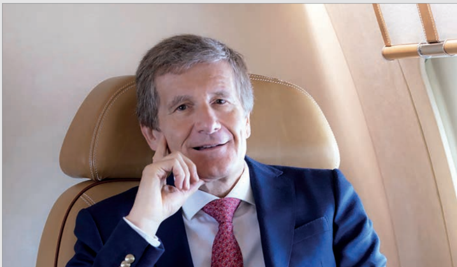
Thierry Boutsen | Chairman & Founder

Thierry Boutsen's passion for aviation began during his studies in mechanical engineering. After graduating, he continued to push his limits both intellectually and physically by becoming a professional racecar driver, eventually becoming a renowned Formula One champion.