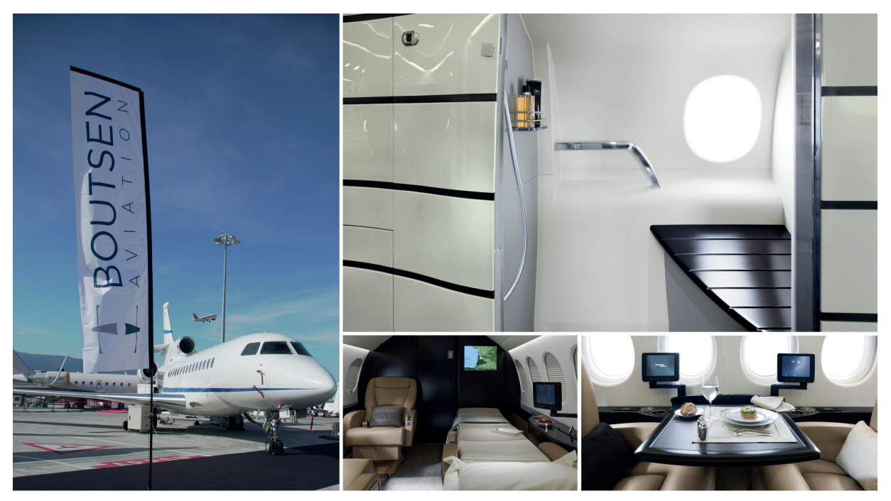
The Falcon 7X MSN 135, which is the only Falcon 7X in the entire world to feature a shower.

Monaco, June 10, 2017 — Though clouds and rain were initially predicted in the forecast, the first day of EBACE 2017 broke with clear blue skies and bright sunshine on the Static Display where Boutsen Aviation was one of 24 companies showcasing aircraft for viewing. Upon entering the Static, the first impressive view your eyes met with was the stunning Falcon 7X MSN 135 , which is the only Falcon 7X in the entire world to feature a shower. This was a highlight of the show, with many visitors flocking to the entrance of the aircraft to see the luxury of a shower on board a 7X. To the left of MSN 135 was another majestic bird, Falcon 7X MSN 036 also for sale by Boutsen Aviation . Sharing the stand was Boutsen Aviation's sister company, Boutsen Design , which was showcasing a selection of Bulgari amenities as well as having decorated the interior of both 7X's.